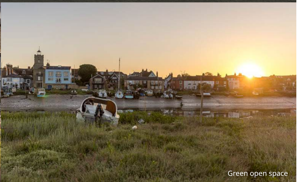
Green open space